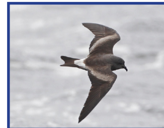
Leach's Storm Petrel