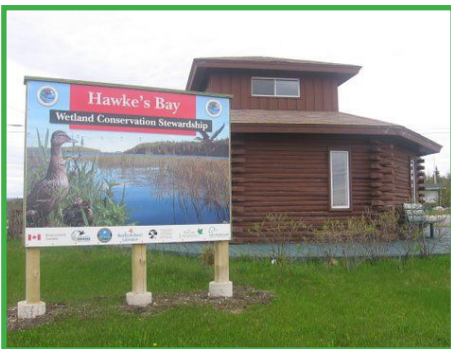
Torrent River Nature Park and Interpretation Centre