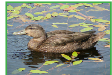
American Black Duck