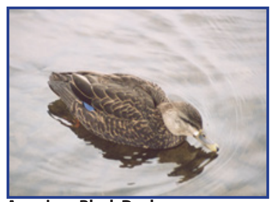
American Black Duck