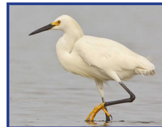
Snowy Egret Egretta thula (rare)