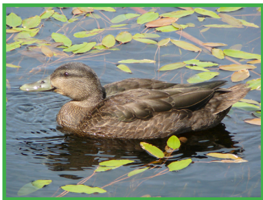
American Black Duck