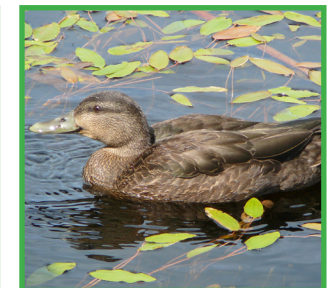
American Black Duck