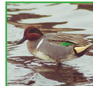
Green Winged Teal