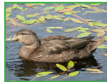
American Black Duck