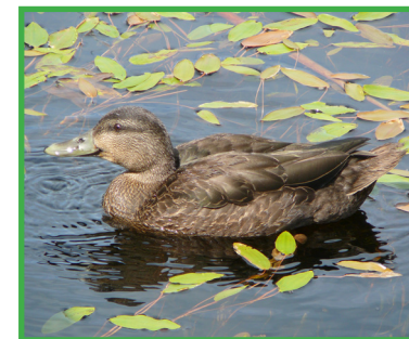
American Black Duck