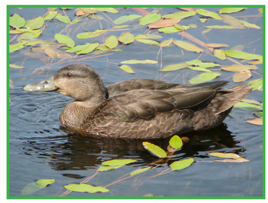
American Black Duck