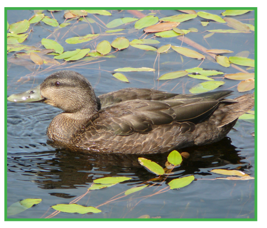
American Black Duck