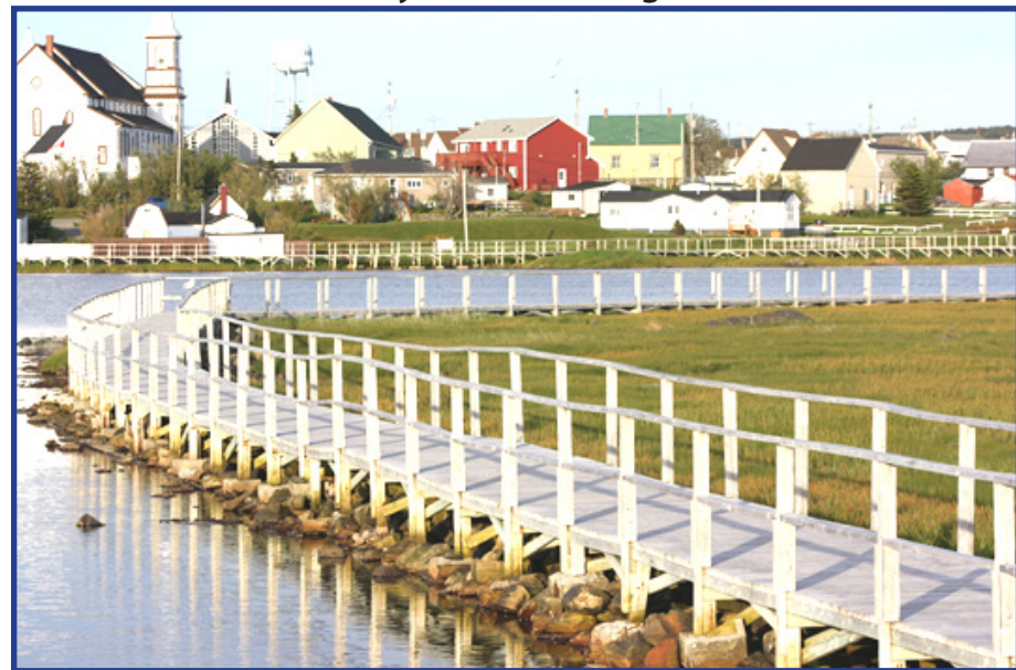
What to look for!