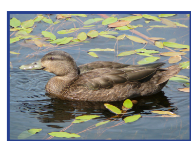
American Black Duck