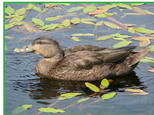
American Black Duck