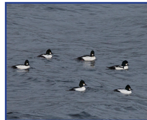
Common & Barrow's Goldeneye