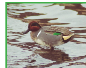
Green Winged Teal