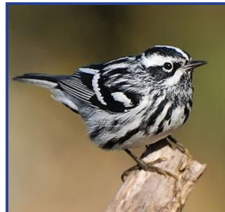
Black and White Warbler