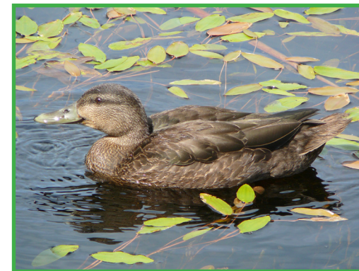
American Black Duck