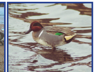
Green Winged Teal