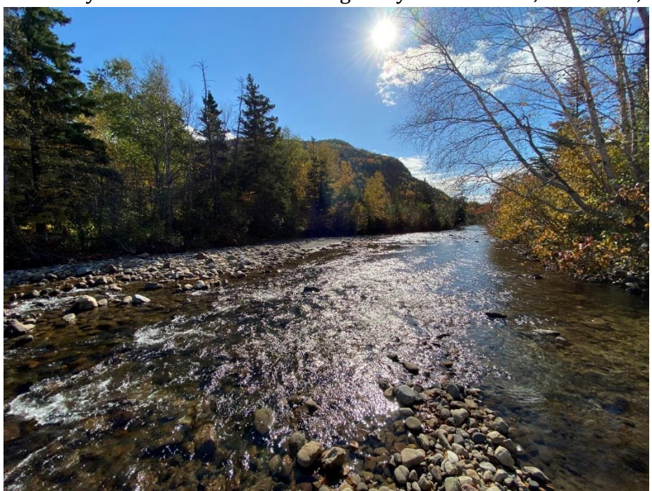
Figures 1 - A beautiful view of lower Hughes Brook with riparian buffer intact. Taken fall of 2022. agricultural expansion.

Globally, human development has resulted in the destruction, degradation, or alteration of many types of habitats. Consequently, in North America the number and diversity of wildlife species has been declining over the latter half of the twentieth century as natural habitats are regularly lost to urban, industrial, and