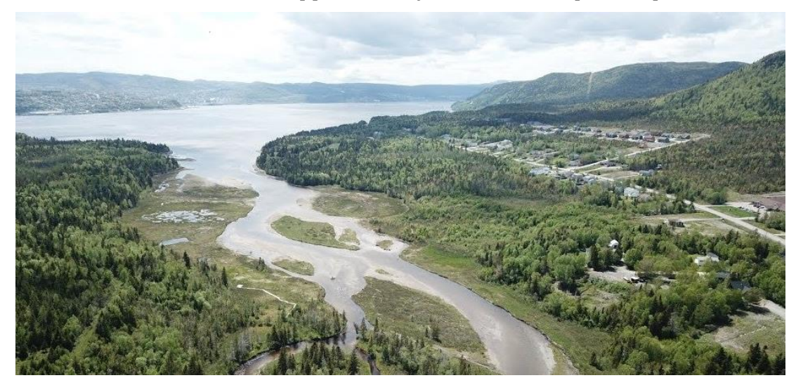
Figure 4 - Hughes Brook Estuary and view of Irishtown-Summerside (Online photo)

The Conservation Area covers approximately 36 hectares of prime riparian habitat